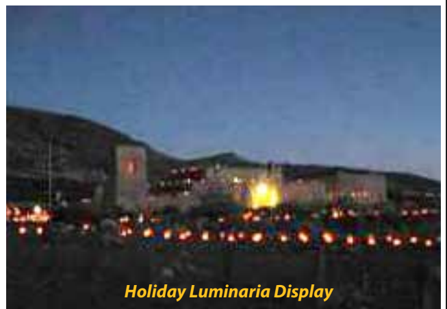
Holiday Luminaria Display

There is no regular meeting in December but we will be making luminarias on Wednesday, December 7 at 10:00 for the Holiday Lights program on Saturday December 10th. We need volunteers for both events.