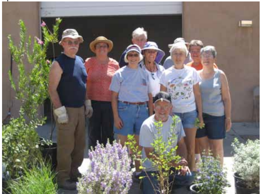
Thursday's crew (minus 7)

We were so busy that the photographer forgot to capture us until many had already left!